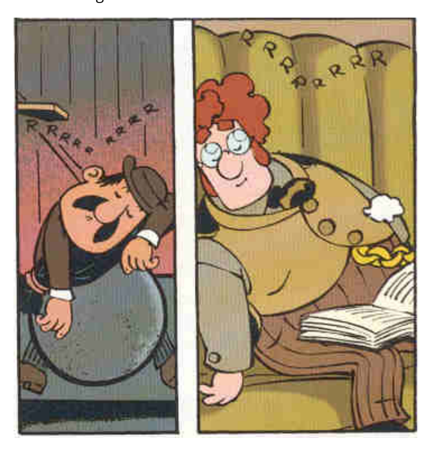
Picture 1. The use of R symbolizing sleep in a German comic magazine (MOSAIK 9/1999 p. 45)

With regard to genre, it should be mentioned that many TV formats of US origin have been adopted by German channels, formats which include talent shows, game shows and talk shows. English influence also includes gestures and symbols. A typical example of the latter is the use of the letter Z to express sleep or boredom. It is increasingly supplanting the letter R , traditionally used in German in the same role (see pictures 1 and 2). In addition, emoticons, such as little x's and o's (representing kisses and hugs), can increasingly be found as closing signals in letters and text messages.